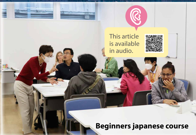
Beginners Japanese course