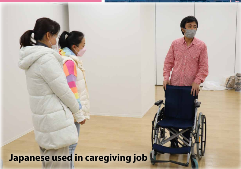
Japanese used in caregiving job