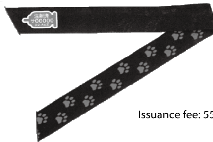
2021 vaccination tag